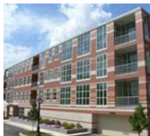
Pembroke North is a 54-unit, sustainable residential condominium project located in Wayne, Pa.

WAYNE, PA. — Philadelphia-based Razak Co. has completed Pembroke North, a three-building, 54-unit residential condominium project located in the Philadelphia suburb of Wayne. The community features one-, two- and three-bedroom residences ranging in size from 1,273 to 2,632 square feet. Prices range from $500,000 to more than $1 million. The project has also registered for LEED certification; sustainable features include windows designed to maximize natural light, energy-efficient appliances, sustainable building materials, and geothermal heating and cooling systems. Pembroke North was designed by Philadelphia architect Robert Venturi.